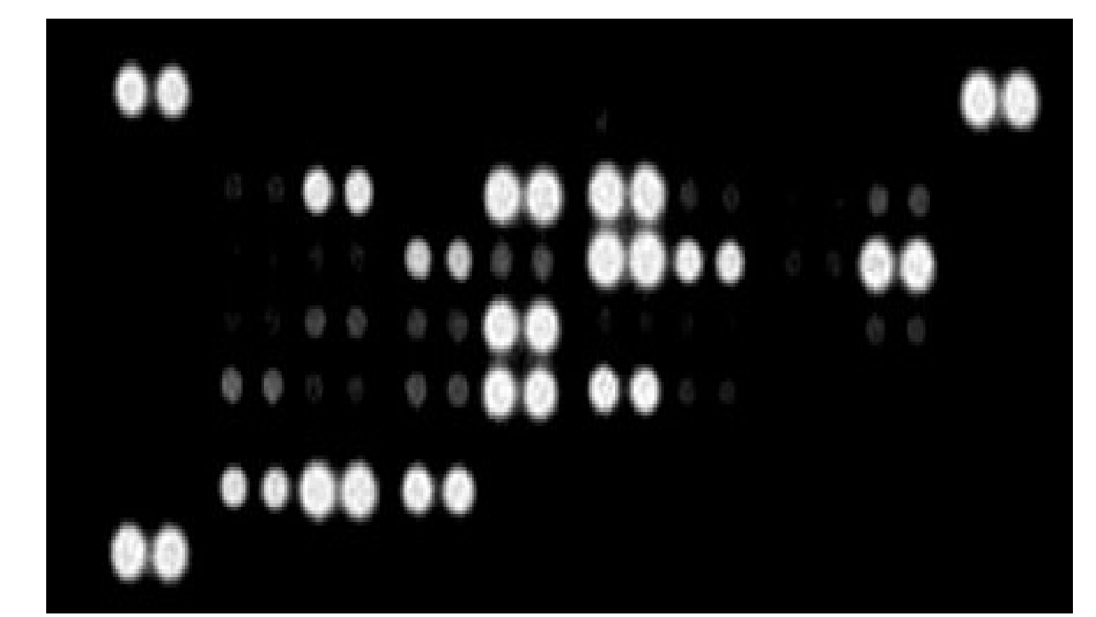
Chemokine production (white circles) in high grade cervical lesions.